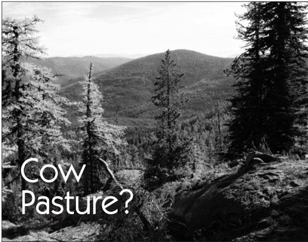
Does this look like a cow pasture? We think not! But this is where the Profanity Peak Pack wolves live(d)...on public land in pristine Colville National Forest (see pgs. 2-3).

If you don't follow us on Facebook or Twitter, you may not have heard much from us recently. Rest assured, we're alive and kicking!