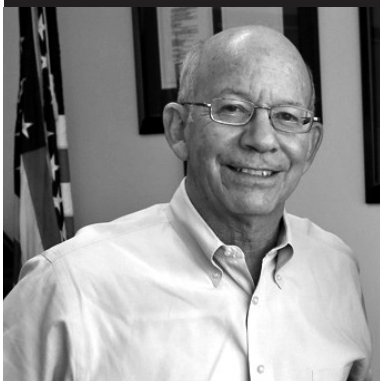
FAREWELL TO OUR GOOD FRIEND, U.S. REPRESENTATIVE PETER DEFAZIO (pg. 2)